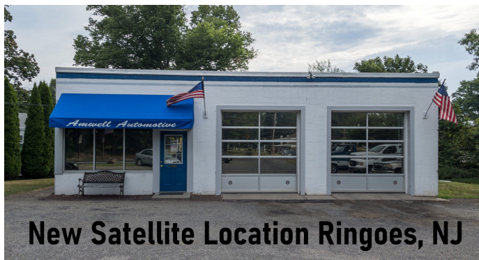
New Satellite Location Ringoes, NJ

Both facilities have the tooling and technical expertise you'd expect from a large service operation, including the dealer.