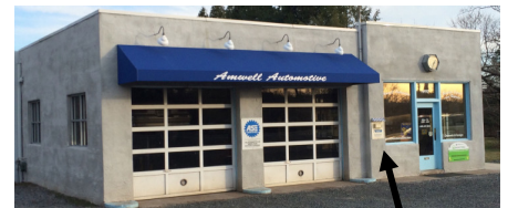
After Hours Drop Box