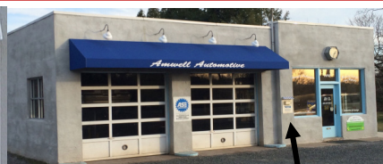
After Hours Drop Box