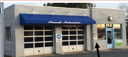
After Hours Drop Box